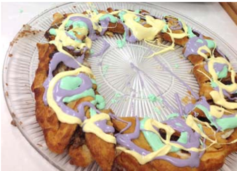
Mardi Gras "King Cakes" for dessert

The Mardi Gras dinner and jazz concert on March 5 was well attended, and people have told me they really enjoyed it. I was really happy with how it went. After paying the band, we cleared $967 for the Brick by Brick fund to restore our historic sanctuary. I was thrilled. I was hoping for $1,000 and that is close! One donor gave over $90. Thank you to the donors and to everybody