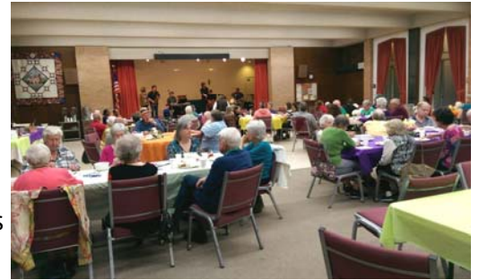
Mardi Gras Dinner and Jazz Concert

Thank you to everyone who helped decorate (after the funeral) and everyone who helped clean up afterwards on Tuesday! We used our ceramic dishes and stainless forks and spoons, not paper and plastic, so we did a lot of washing up.