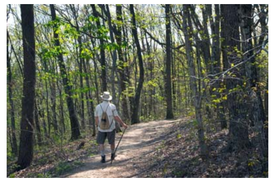
Lent is a journey of preparation for following the way of Jesus.

Lent is a time of repentance, fasting and preparation for the coming of Easter. It is a time of selfexamination and reflection. In the early church, Lent began as a period of fasting and preparation for baptism by new converts and then became a time of penance by all Christians. Today, Christians focus on relationship with God, growing as disciples and extending ourselves, often choosing to give up something or to volunteer and give of ourselves for others.