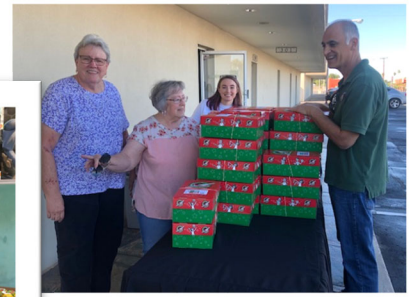
Members of the Mission Committee fill and deliver shoeboxes for Operation Christmas Child.

Our Mission Team is looking for other programs where we can give our time and financial support. Please contact any Mission team member or the church office if you have a program you'd like us to consider. We want to