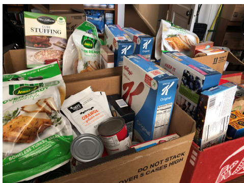
Thanksgiving food boxes containing a full turkey dinner and additional meals.

We at the Riner Office would like to thank you for your continued support, and wish you all a blessed and joyous Christmas.