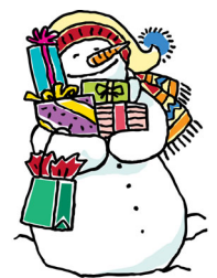
Gifts for the Staff

Finally, it's December! Every year during December we collect money towards our staff Christmas gifts. Please make a donation this year. Just mark your check as "Staff Gift" and deposit in the offering. Let's make this a joyous Christmas season for our dedicated employees, who do so much to keep our church going.